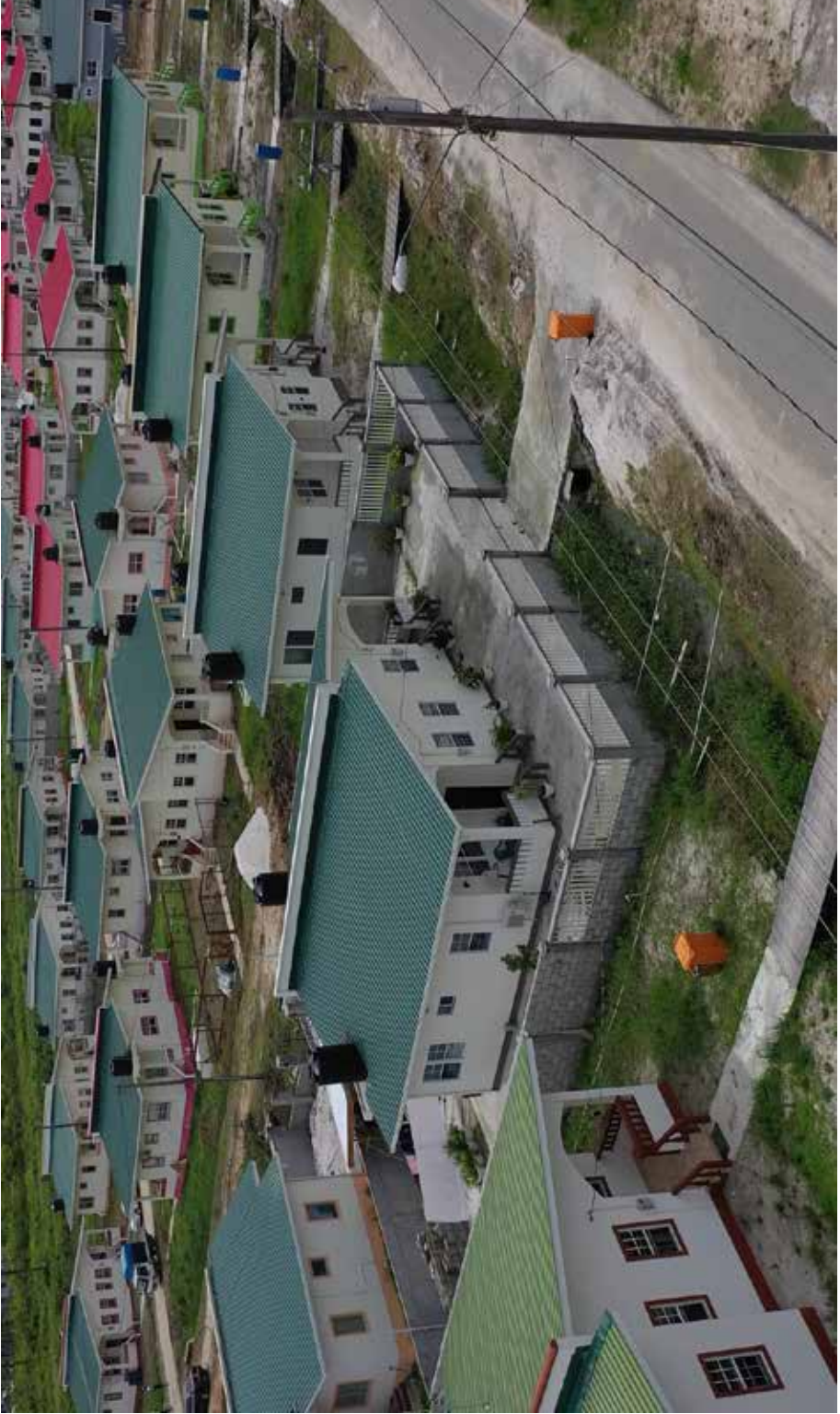
Providing safe and affordable housing