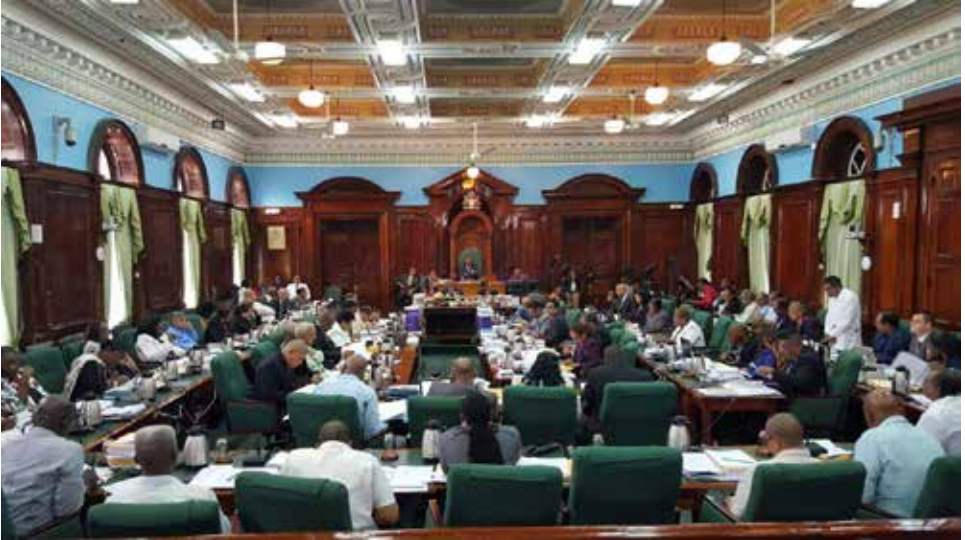
The National Assembly in Session