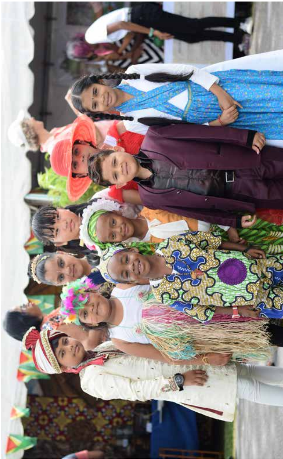
Children are our Future