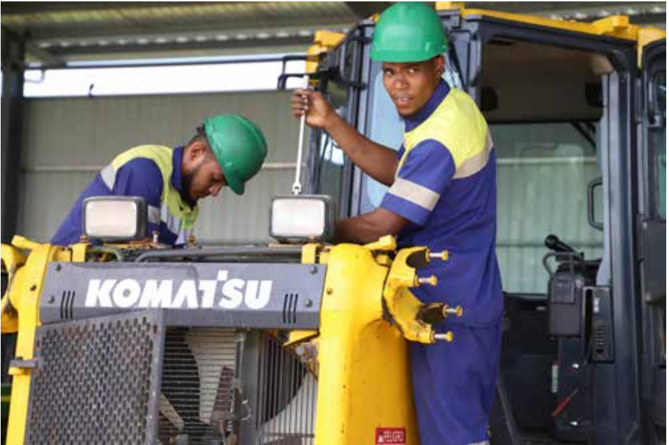
Local work force development and utilisation.

co-generating electricity for the national grid;