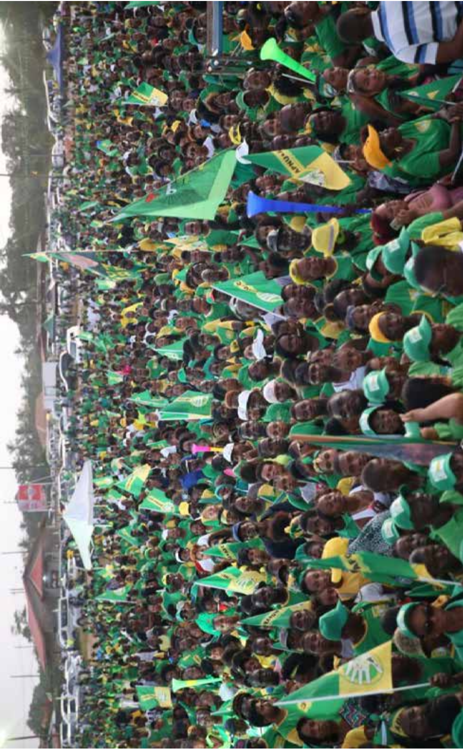
APNU + AFC Moving Forward Together