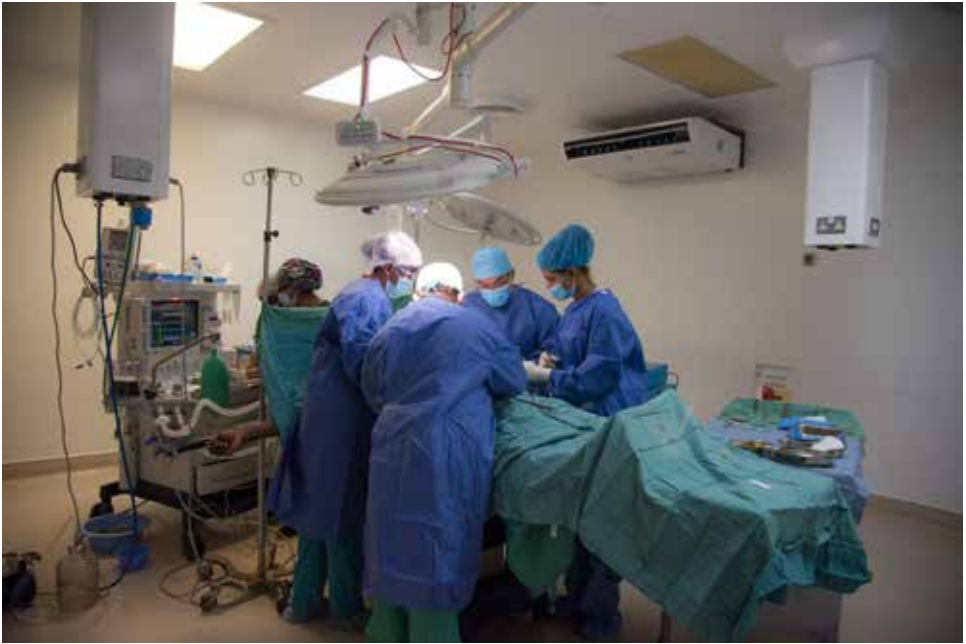
Improving Health Care delivery.

attending Technical Institutes, Nursing Schools, School of Home Economics, Guyana School of Agriculture;