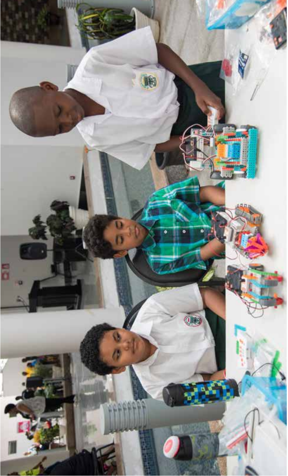
Easy access to quality education.